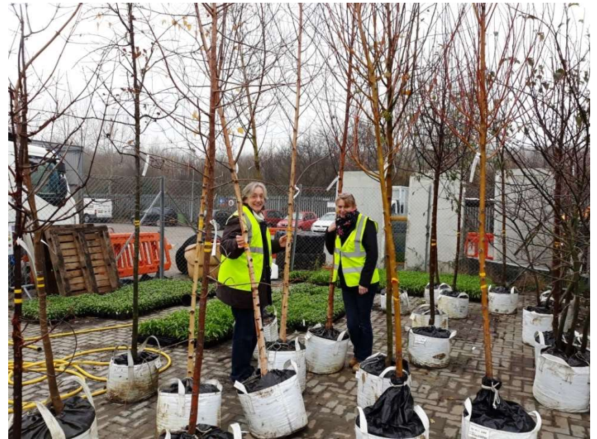
Autumn 2018 – planting at “Town hall Green”