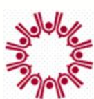
North West Kent